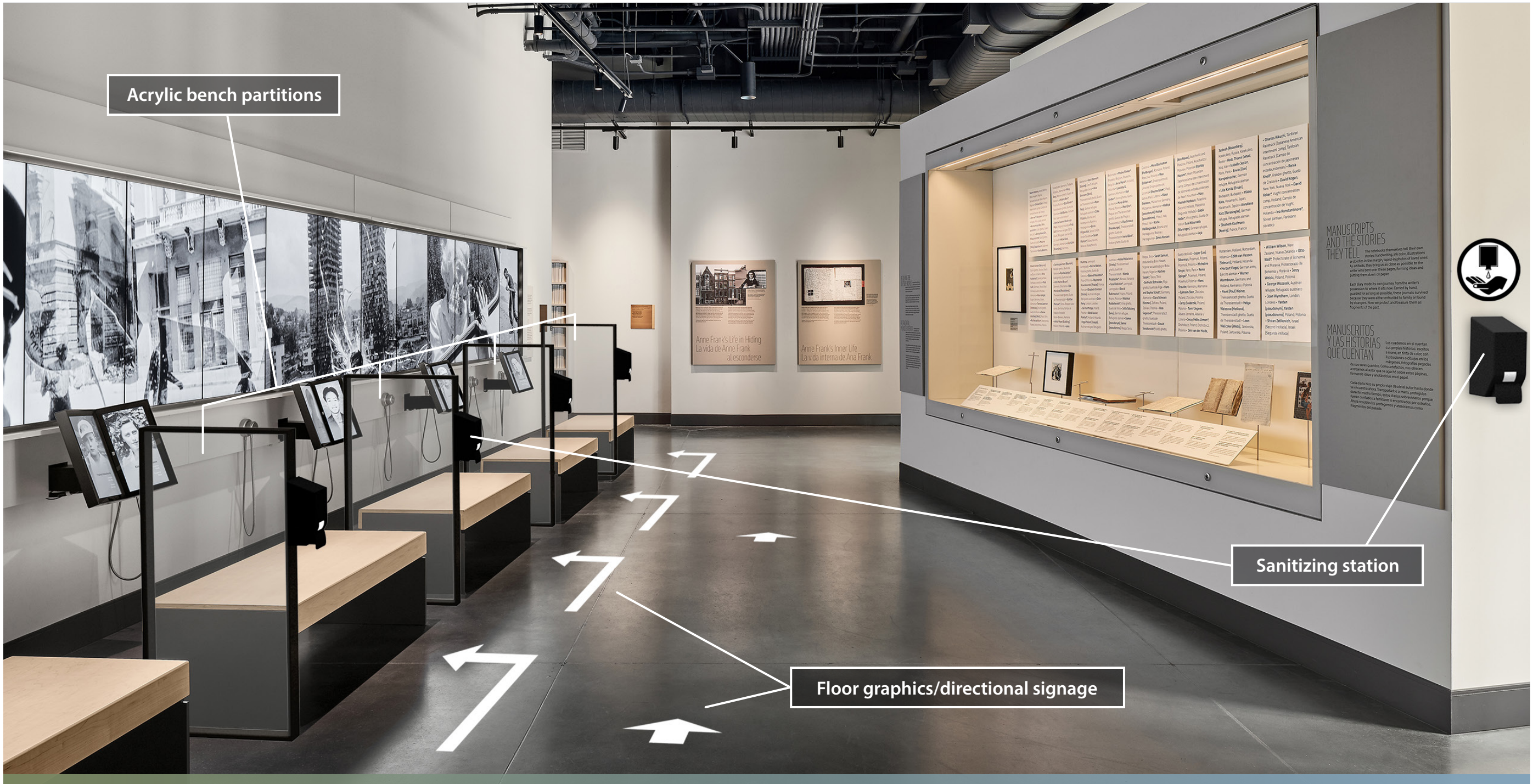
Acrylic bench partitions